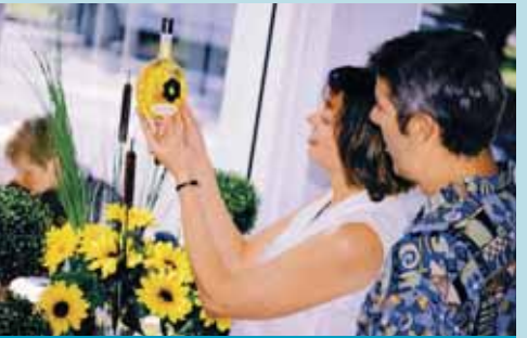
Attraction / Activities

You'll discover unspoilt natural beauty and the finest art, wine and food here.