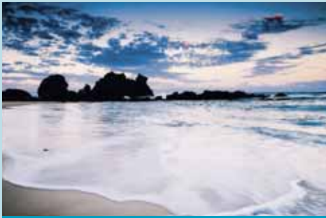
Sapphire Coast Attraction / Activities

Rates: From $175 to $250 per room per night*