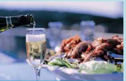
Attraction / Activities

Feast on flavour Enjoy the freshest seafood, delight in country markets and savour wines at the cellar door.