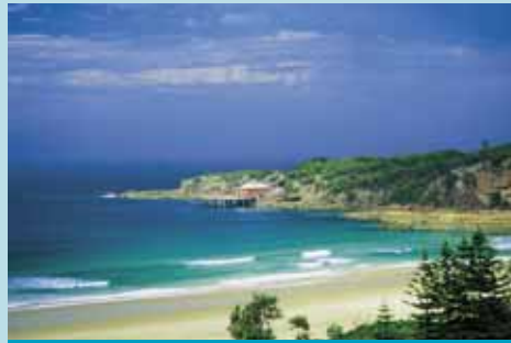
Tathra to Bermagui

Telephone 1800 150 457 email: bookings@sapphirecoast.com.au www.sapphirecoast.com.au